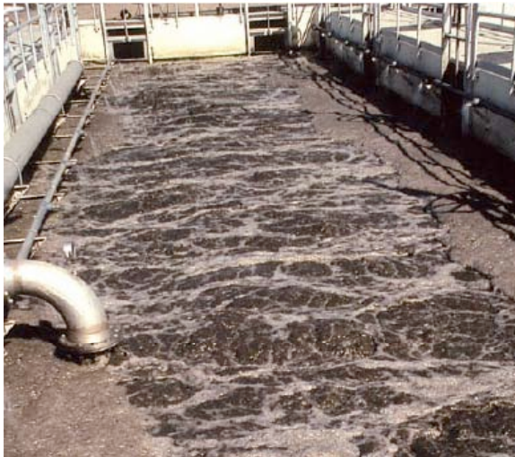
Figure 3. An activated sludge system of secondary sewage treatment.

What are the similarities between winemaking and activated sludge sewage treatment?