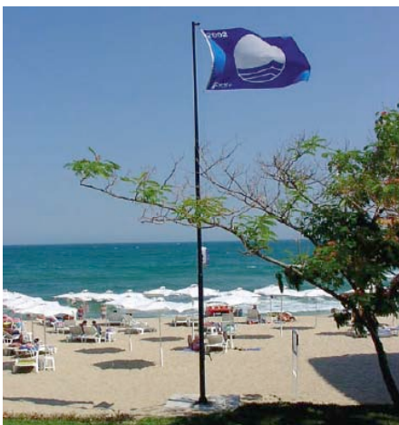
Figure 1. A beach displaying a blue flag. What sort of bacterial populations would need to be quantified to set standards for beach-area waters?

Until environmental awareness intensified, a surprising number of large American cities had only a rudimentary sewage treatment system or no system at all. Raw sewage, untreated or nearly so, was simply discharged into rivers or oceans. A flowing, well-aerated stream is capable of considerable self-purification. Therefore, until expanding populations and their wastes exceeded this capability, this casual treatment of municipal wastes did not cause problems. In the United States, most cases of simple discharge have been improved. But this is not true in much of the world. Many of the communities bordering the Mediterranean dump their unprocessed sewage into the sea. At one Asiatic tourist resort, a hotel posted instructions that toilet paper was not to be flushed in the toilets—presumably because floating paper would make it clear that the sewage outlets were near the beach. In areas of Europe and South Africa where tourism is essential to the economy, local administrations are attempting to reassure visitors about bathing water quality with the Blue Flag campaign. The presence of the flag ( Figure 1 ) shows that the coastal waters meet certain minimal standards of sanitation.