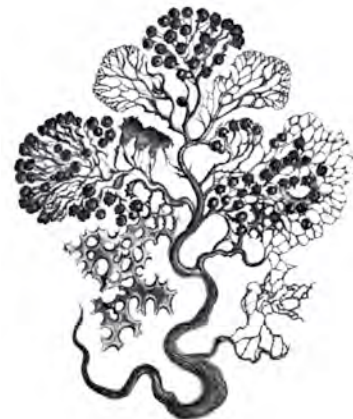
Physarum , a plasmodial slime mold.

Laboratory Drawer: One lab drawer will be assigned to each pair of students during the first laboratory period. Combination: Check your drawer contents against the inventory list. You will be responsible for these materials. Keep them clean and in good condition.